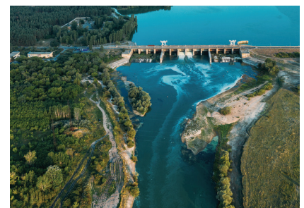
Our multiple generation sources include hydro, wind and solar power from across the country.